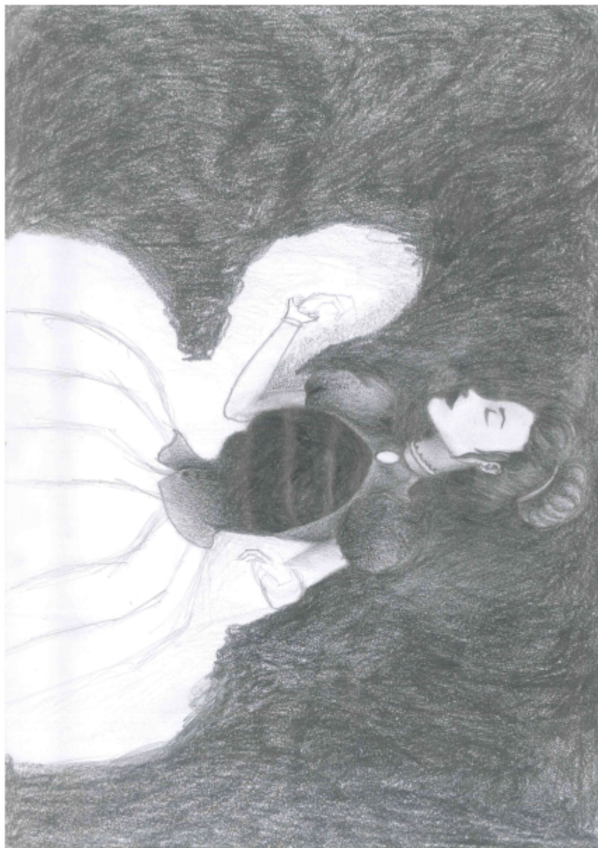
Avtor: Leonardo Čuš Gerževič, 1. c